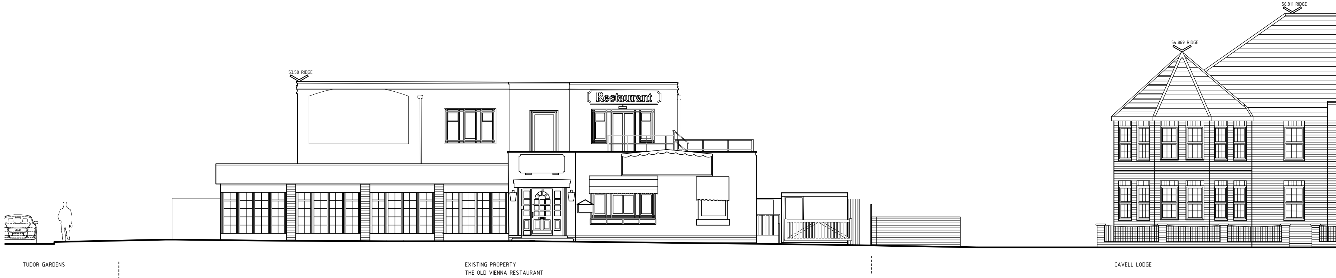
AS EXISTING: SOUTH ELEVATION

This drawing is to be read in conjunction with all Architect's drawings, schedules and specifications, and all relevant consultants' and/or specialists' information r elating t o the project. Refer all discrepancies to DAP Architecture Ltd.